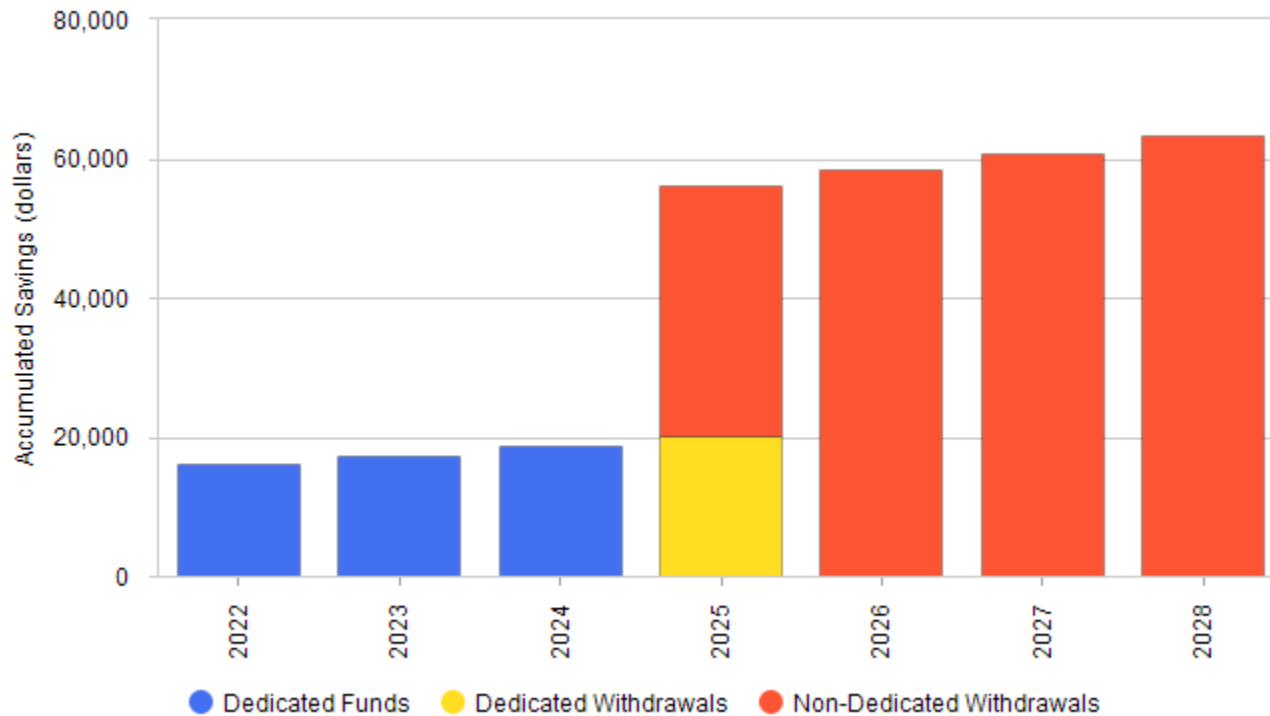
Savings and Withdrawals for College for Lucas

The projected shortfall from dedicated assets toward College for Lucas is $218,721 or 92% underfunded . Non-dedicated assets are assumed to fund the remaining goal shortfall.